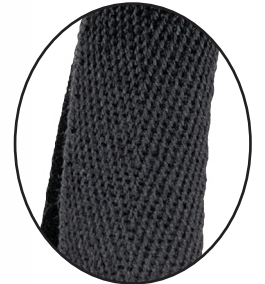
Close up of cotton twill-handle